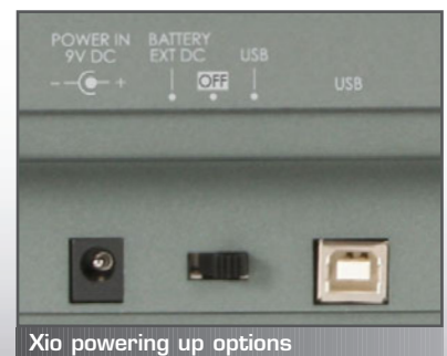
Xio powering up options

When the unit is connected and plugged in, the switch on the rear of the keyboard should be set into the appropriate position, as follows: